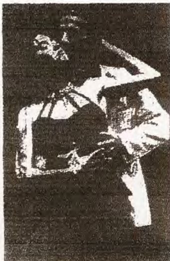
REFLECTIVE: Forever Tango